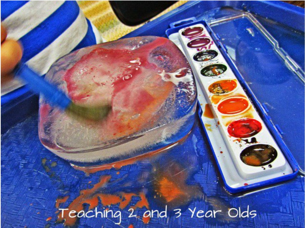
Teaching 2 and 3 Year Olds