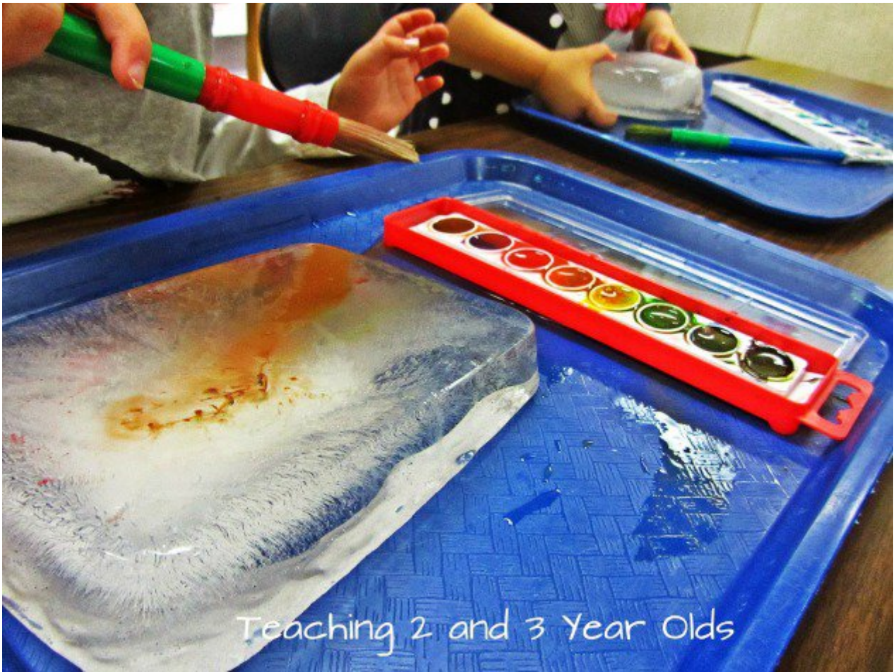
Teaching 2 and 3 Year Olds